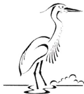
GREAT BLUE HERON NATURE RESERVE

Join us for a walk to see the Great Blue Herons' nesting colony. At the beginning of March the herons gather to court and repair or build nests. In 2015 there were 145 active nests! Come learn about these beautiful birds and their life at the Heron Reserve. Meet at the Rotary Interpretive Centre for a 10 am start.